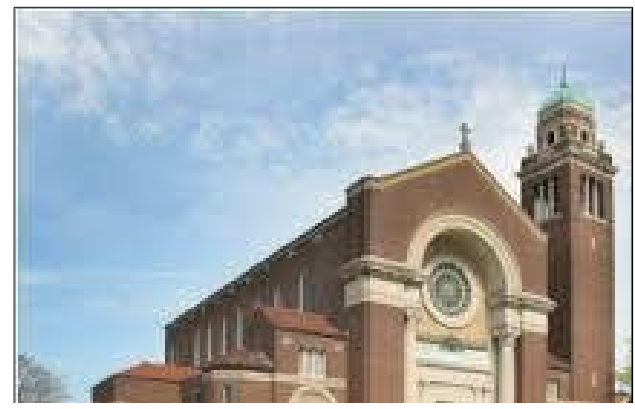
Praised Be JESUS CHRIST!